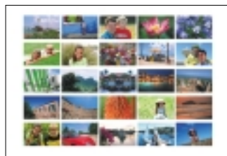
• Index Print