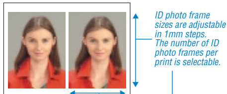
• ID Print (2 up)

ID photo frame sizes are adjustable in 1mm steps. The number of ID photo frames per print is selectable.