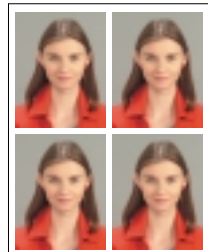
• ID Print (4 up)

* Except for 79 × 100mm and 100 × 110mm sizes.